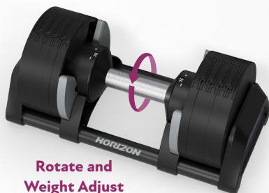
Rotate and Weight Adjust

Simply twist the handle and feel the click to select your weight and start your set. A clearly marked indicator makes it quick and easy to set a weight right for your ability level.