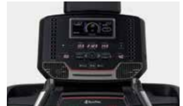
High-contrast, color LCD