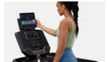
Use a phone or tablet to access JRNy® 1