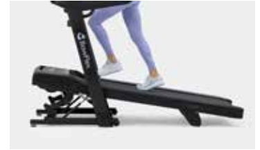
Up to 15% motorized incline