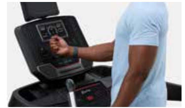
Connect to Apple Watch/Galaxy Watch